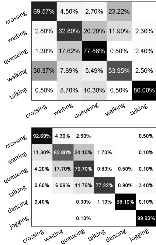
Figure 2. Recall matrices (i.e., row-normalized confusion matrices) for the 5- and 6-activity datasets, using the HL-MRF + ACD model.